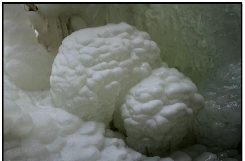
Right: Closeup of ice balls forming on a cavern floor from the waterfalls.