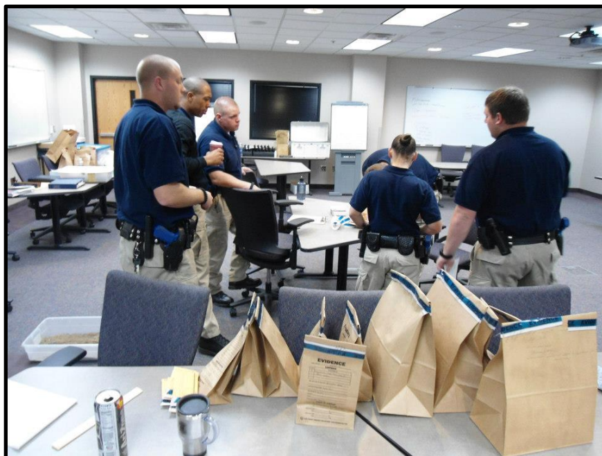
Students from the 150 th Session of the Basic Officer Certification Course process evidence from a mock crime scene.

This publication of Crime in South Dakota 2012 represents approximately 95% of the population as reported by 51 Sheriff's Offices, 65 Police Departments, Division of Criminal Investigation and SD Highway Patrol.