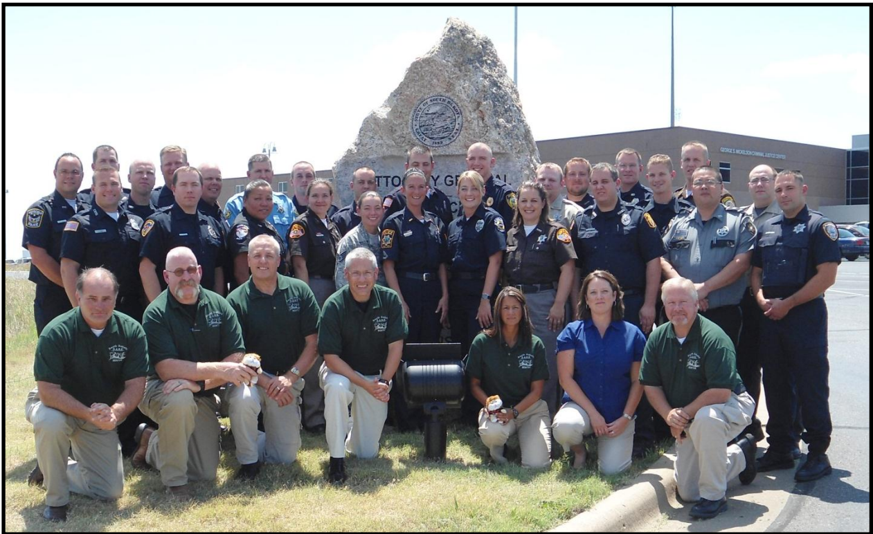
Students and Mentors from the DARE Class held July 9 - 20, 2012.