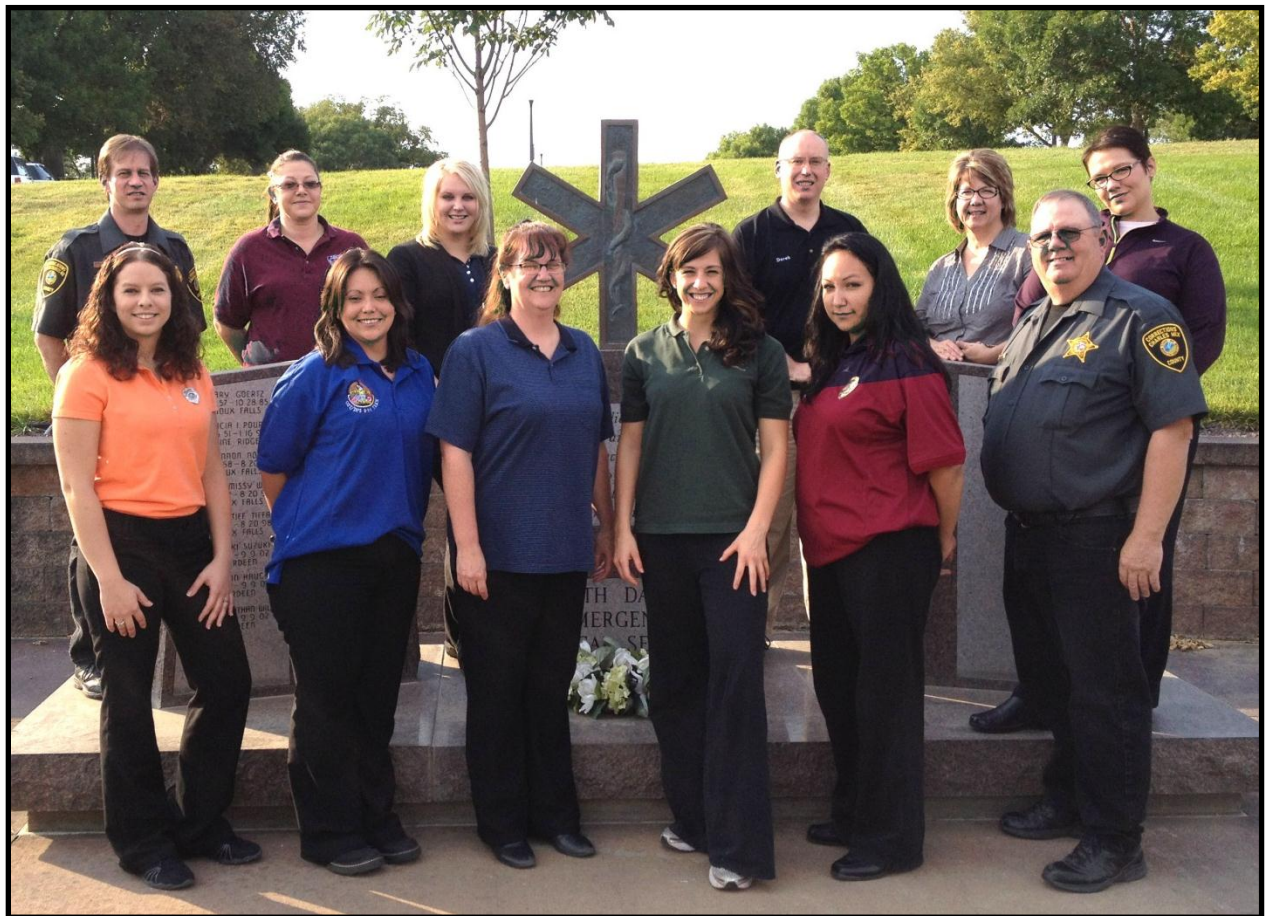
Students from the 41 st Session of the 911 Telecommunicator Class held September 10 - 21, 2012.

Asian or Pacific Islander - A person having origins in any of the original peoples of the Far East, Southeast Asia, the Indian subcontinent, or the Pacific Islands. This area includes, for example, China, India, Japan, Korea, the Philippine Islands, and Samoa.