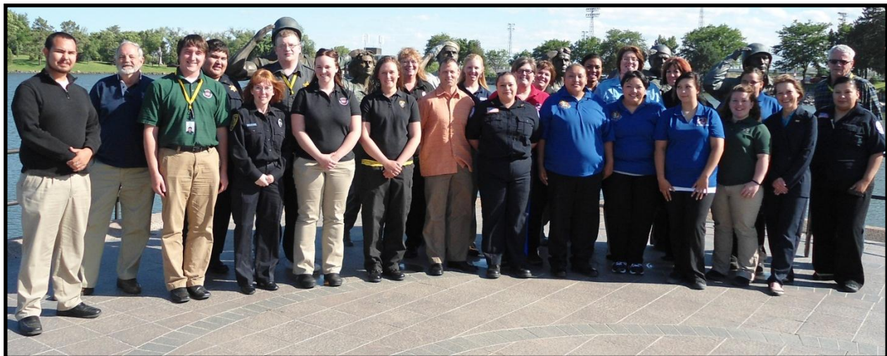
Students from the 40 th Session of the 911 Telecommunicator Class held June 4 - 15, 2012.

An agency reports property stolen in their jurisdiction. Likewise, the agency that reported the property stolen should also report the property recovered. The following table shows the Type of Property Loss per Property Description.