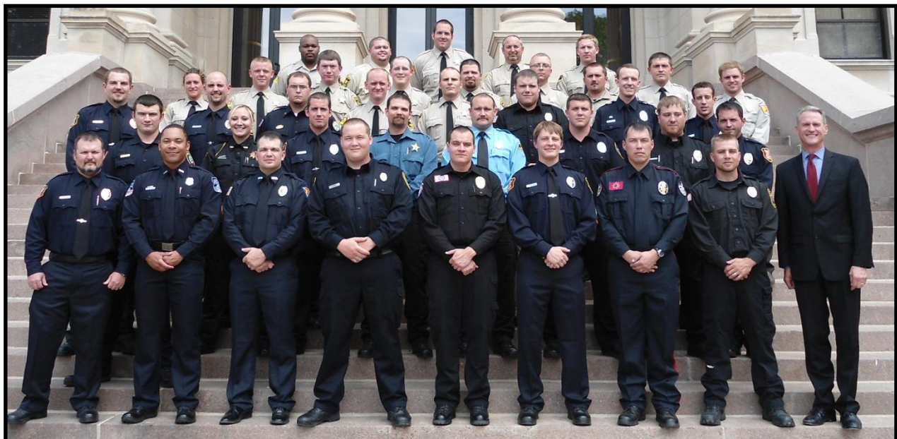
Students from the 149 th Session of the Basic Officer Certification Course held February 26, 2012 through May 24, 2012. Students are accompanied by Governor Dennis Daugaard who is South Dakota's 32nd Governor (far right).