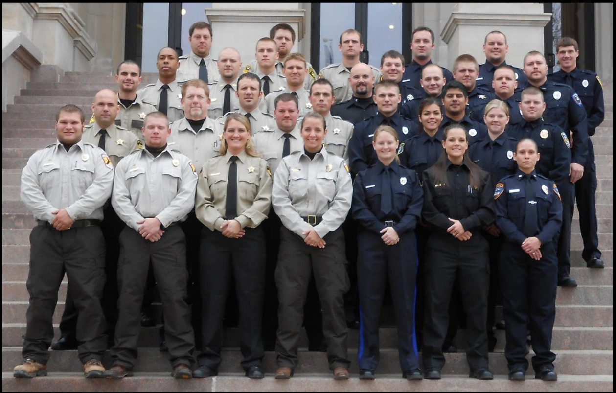
Students from the 150 th Session of the Basic Officer Certification Course held August 19, 2012 through November 16, 2012.