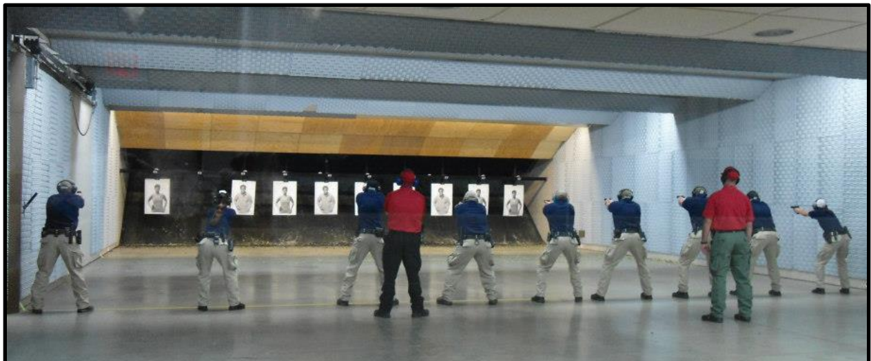
Students from the 150 th Session of the Basic Officer Certification Course practice shooting in the indoor firearms range.