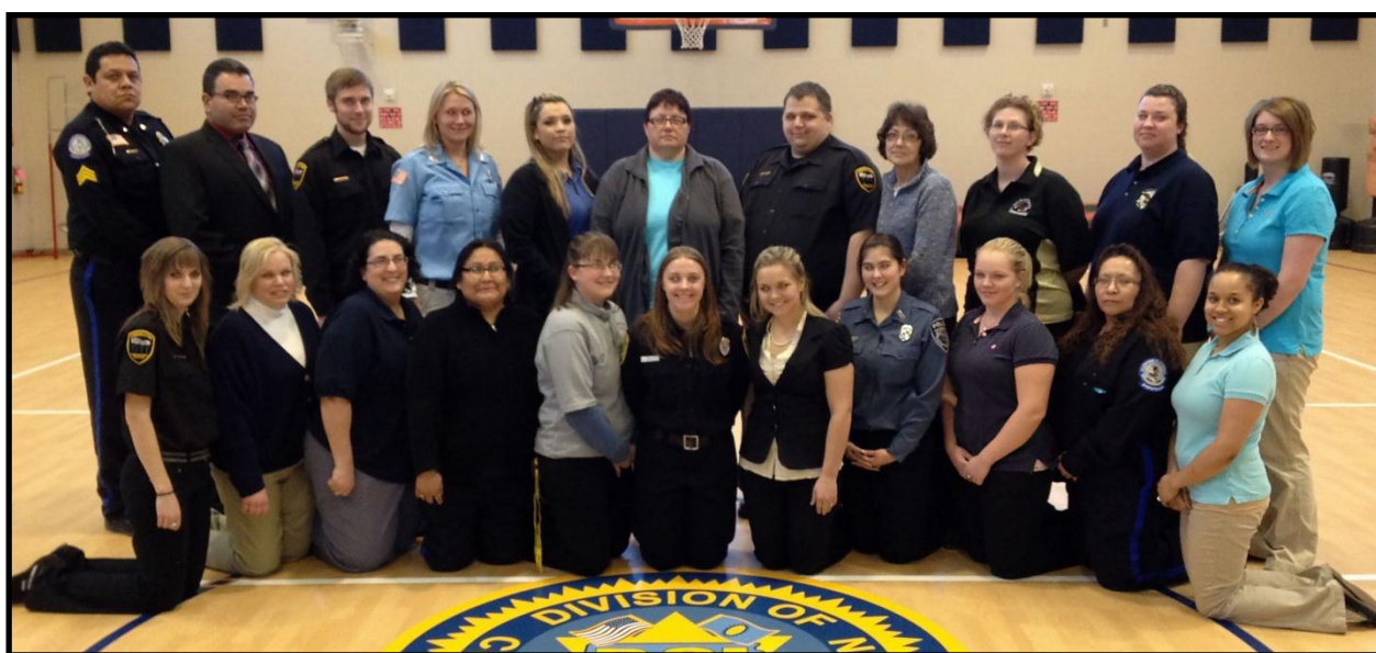
Students from the 39 th Session of the 911 Telecommunicator Class held February 6 - 17, 2012.