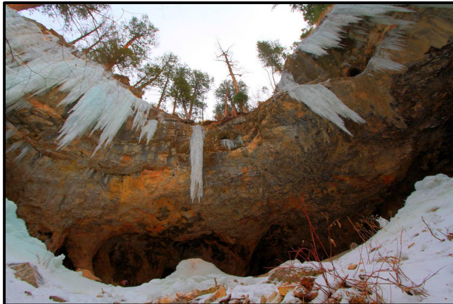
Left: Looking upward and towards the caves.

Community Caves (sometimes called Bobcat or Wild Cat Cavern) is a unique natural feature in Spearfish Canyon. In the winter, it is a massive frozen waterfall and in the summer the small waterfall just trickles. A waterfall pours down the mouth of the largest cavern, inside of which are smaller, individual caves.