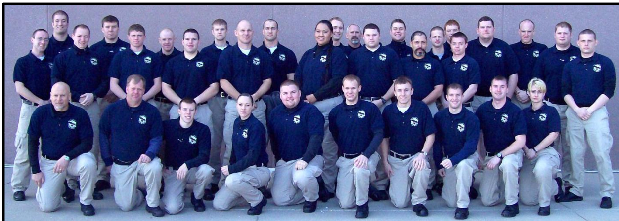
Students from the 148 th Session of the Basic Officer Certification Course held November 28, 2011 through March 2, 2012.

In NIBRS, incidents that do not involve any facts indicating biased motivation on the part of the offender are reported as "None", whereas incidents involving ambiguous facts (some facts are present but are not conclusive) are reported as "Unknown".