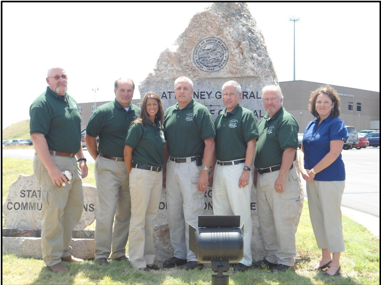
Mentors from the DARE Class held July 9 - 20, 2012.